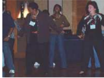
Monday Night Dancing