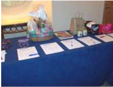
Community Outreach Committee: Items for Silent Auction